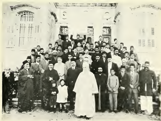
ABDUL BAHÁ WITH A GROUP OF BELIEVERS AT HIS HOUSE IN HAIFA